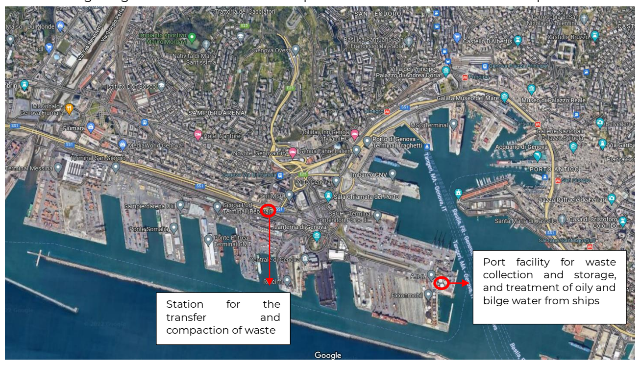
Figure 1 – Location of the facilities, Ports of Genoa

The following image shows the location of the port waste collection facilities in the ports of Genoa.